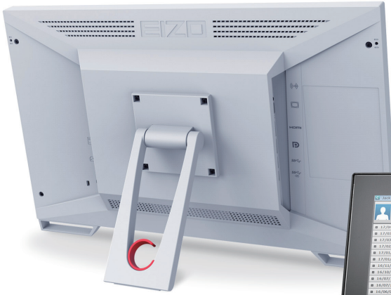
Cabinet Color: Gray